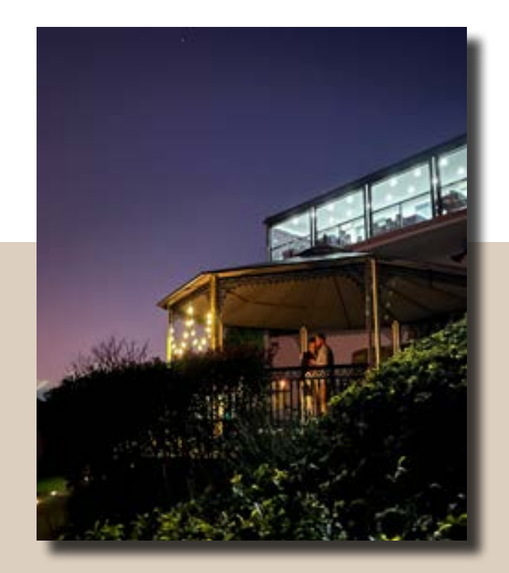
Make your next event truly memorable

We offer a range of unique spaces and dining options catering to your needs.